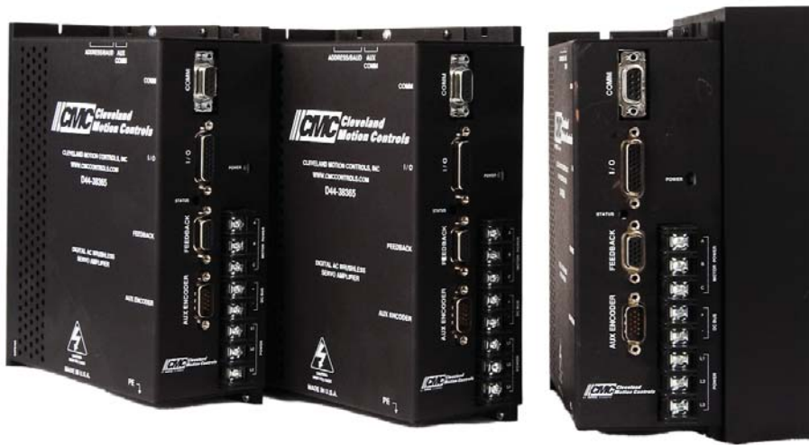
D50P and D60P models

The ServoPak K Series can adapt to any machine or performance configuration. The D80 model is a self contained system containing up to four drive amplifiers for up to four axis of coordinated motion. The enclosure also contains all interface circuitry. The D80 is mounted inside a sealed enclosure and can easily be mounted to any machine. The D50P and the D60P models are sold as individual modular drive amplifiers for custom mounting. Individual amplifiers allow for complete flexibility when mounting the drive amplifiers along with ability to drive an unlimited number of motors. For high duty cycle applications where high current operation is required, the D60P includes additional heat dissipation.